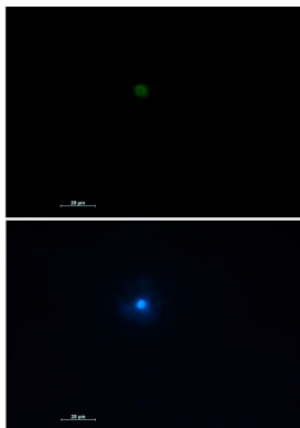
Immunocytochemistry analysis of TNFAIP3 (green) in HL-60 using TNFAIP3 antibody, and DAPI (blue).