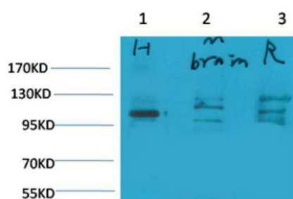
Western blot analysis of 1) Human Brain Tissue, 2) Mouse Brain Tissue, 3) Rat Brain Tissue with Glutamate Receptor 1 Rabbit pAb diluted at 1:2,000.

Immunohistochemical analysis of paraffin-embedded Rat Brain Tissue using Glutamate Receptor 1 Rabbit pAb diluted at 1:200.