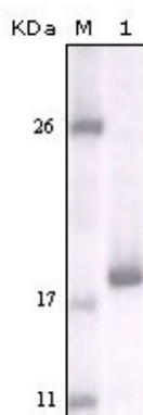
Figure 1: Western blot analysis using DDR2 mouse mAb against truncated DDR2 recombinant protein.